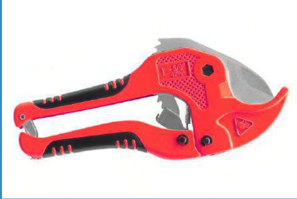
Forza Pipe Cutters