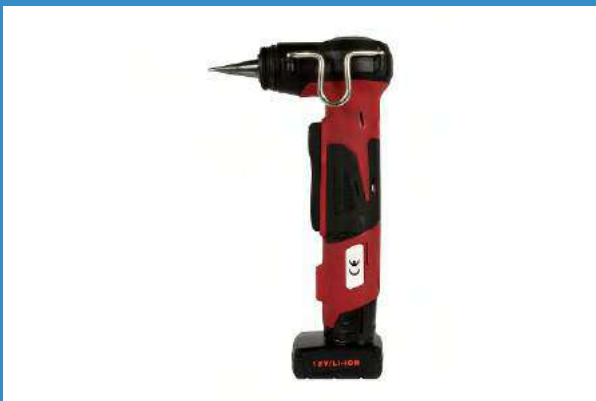
ForzaPlas Expansion Tool