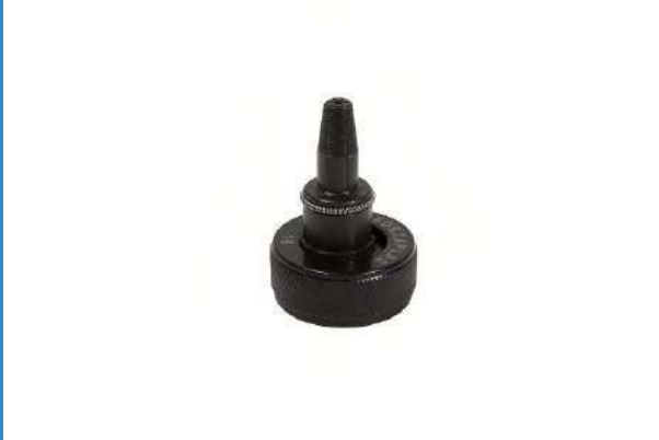
ForzaPlas Expander Heads Available in 16 and 20mm