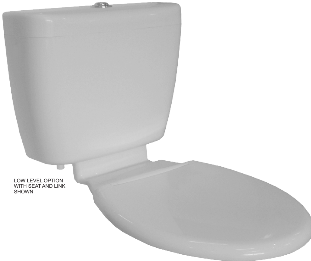
LOW LEVEL OPTION WITH SEAT AND LINK SHOWN

6/3 LITRE FLUSH (CONVERTIBLE TO 9/4.5 LITRE)