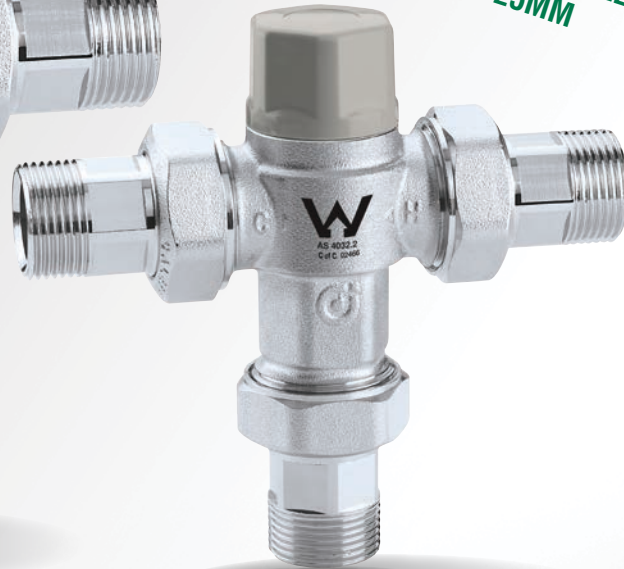
STANDARD GREY CAP 15 - 25MM