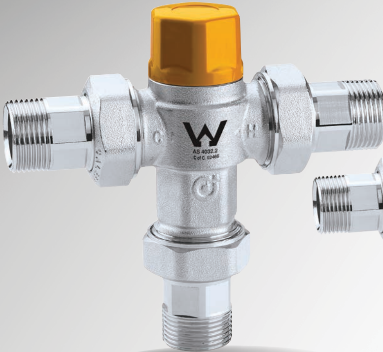
SOLAR HP YELLOW CAP 15 - 20MM