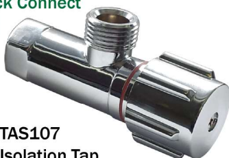
TAS107 Isolation Tap w/ Auto Reset Flood Stop