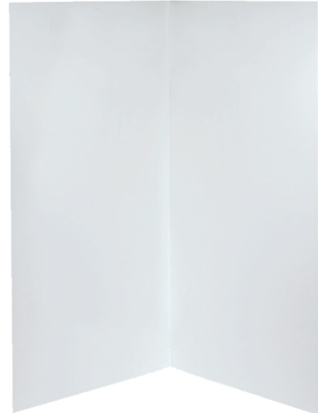
Two-sided model shown

* Three sided models only fit Flinders SMC shower bases