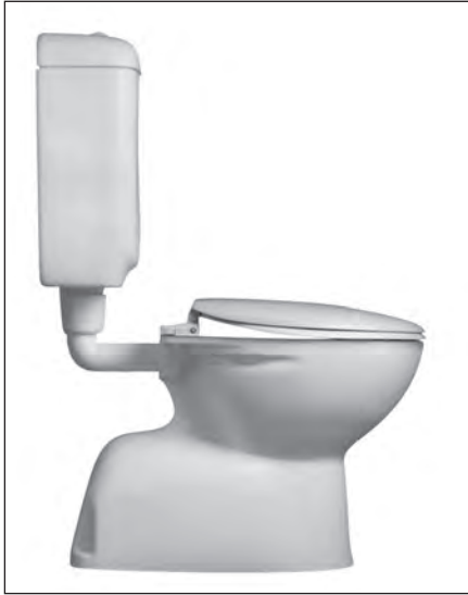
Shown with Sovereign 2000 Cistern

A distinctive 4.5 litre vitreous china toilet pan featuring rounded contours with a concealed trap for easy cleaning. The Trident Smartflush pan can be coupled with the range of Caroma exposed and concealed cisterns for optimum matched suite performance. Suitable for general purpose applications.