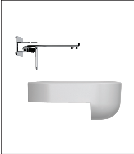
Tapware shown not included.

Classic and relaxed. The subtle, subdued curves of Luna basins will effortlessly flow into any contemporary bathroom design. This basin is suitable for domestic and commercial applications.