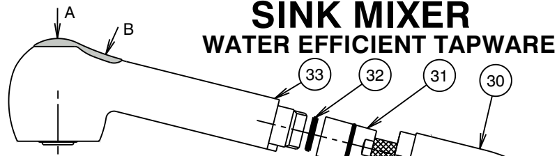
SPRAY HEAD - TWO FUNCTIONS