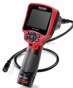
micro CA-350 Monitor Inspection Camera Catalogue No. 57358