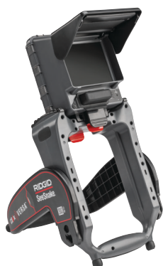
CS6x Versa Monitor Catalogue No. 64943