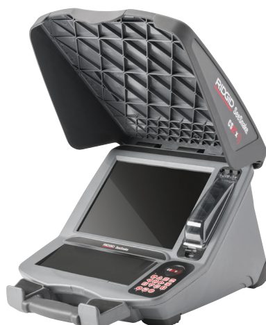
CS12x Monitor Catalogue No. 57283