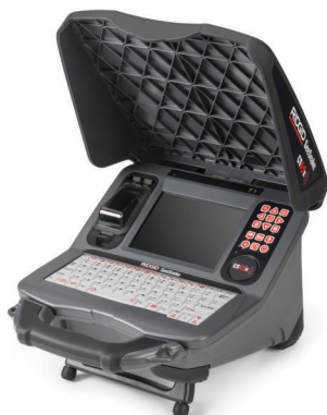
CS65x Monitor Catalogue No. 54368