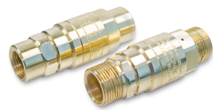
PSL50 and PSL75

RMC's PSL Pressure Limiting Valves regulate the inlet supply line pressure to a preset maximum preventing over-pressure situations. PSL Pressure Limiting Valves are ideal for installation with high pressure storage water heaters, water meter assemblies, water softeners etc.