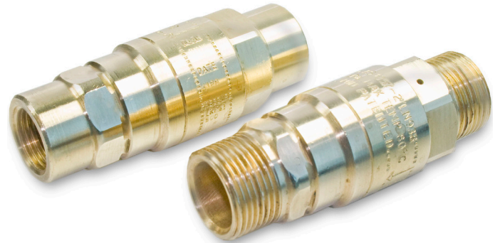
PSL50 and PSL75

RMC's PSL Pressure Limiting Valves regulate the inlet supply line pressure to a preset maximum preventing over-pressure situations. PSL Pressure Limiting Valves are ideal for installation with high pressure storage water heaters, water meter assemblies, water softeners etc.