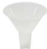
Anode support Secures the anode in place, preventing damage

ENAMEL – Exclusive Rheem Ultraname® Class Y enamel is more durable than domestic grade Class X enamels, and being less soluble can prolong the life of the water heater.