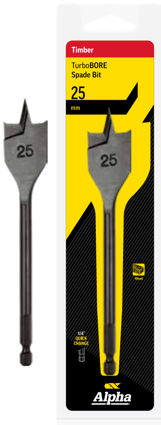
CARDED 1 PCE Supplied on hangable card