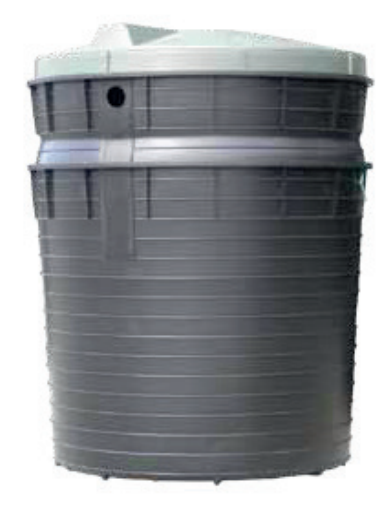
4000L Septic Tank

*It is a legal requirement that all domestic septic tanks over 2050L in NSW & VIC be installed with a partition. Larger capacity collection wells available using multiple tanks.