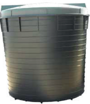
2500L Septic Tank - Deep Invert/ 3000L Septic Tank