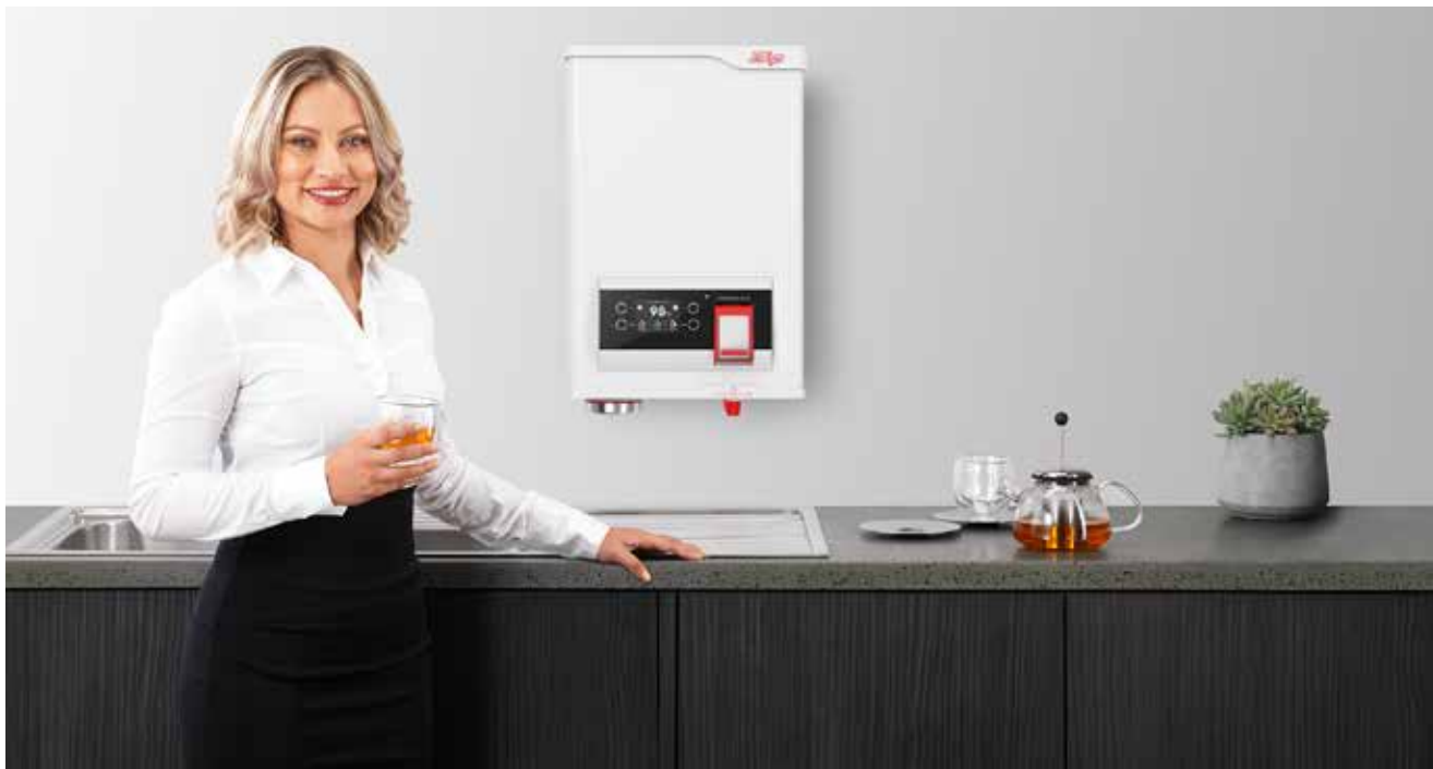
Featured product 5.0 Litre Hydroboil Plus White